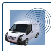
Electronic Logging Devices