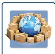
Small Package Shipping & Courier